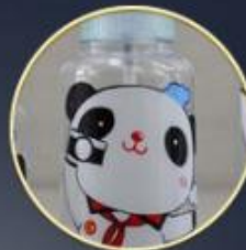
HEAT TRANSFER PRINTING