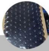
3. Bottle cap independent packaging with protective film