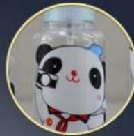
HEAT TRANSFER PRINTING