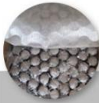
1. Bottle cap independent packaging