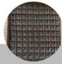
4. Bottle carton independent partition water access dust-proof material film