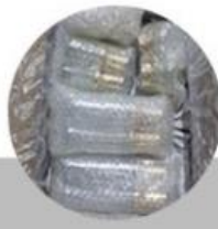
2. The outer thickened air cushion film bottles wrapped with multi-layer bubble bead film