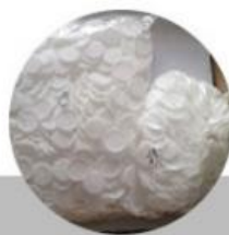
5. The hand mat is packed in a waterproof dust plastic bag