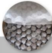
1. Bottle cap independent packaging