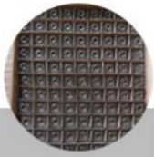
4. Bottle carton independent packaging water access dust-proof material film