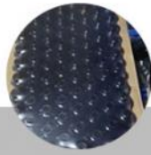
3. Bottle independent packaging