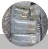
2. The outer thickened air cushion film bottles wrapped with multi-layer bubble bead film