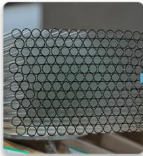
1 Raw materials