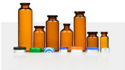
Bayonet Glass Bottle >>