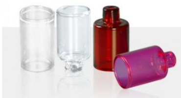
Glass Concentrate Jar »