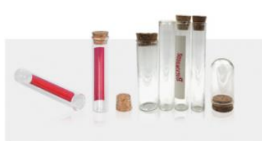
Straight Mouth Glass Bottle »