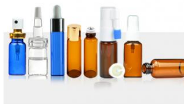
Screw Glass Bottle »