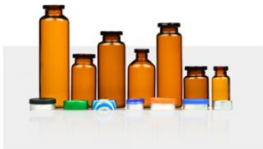
Bayonet Glass Bottle »